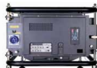
LIGHTNING 38 WUXGA 3D Back Panel